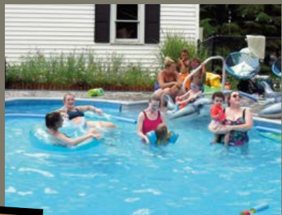
Family and friends cooling off in our pool