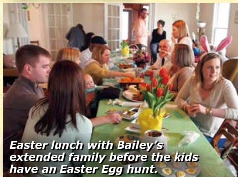
Easter lunch with Bailey's extended family before the kids have an Easter Egg hunt.