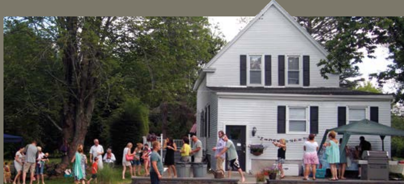
Above: Family and friends together for a BBQ in the backyard.

Our home is an updated farm house from the 1890's, in a suburban neighborhood. It is a warm and cozy home with plenty of room to start our family in. We love hosting Christmas in our home where we can watch our niece and nephew open gifts. In the summer our backyard is the place to be! We have a salt water swimming pool with a fun water slide. Our friends and family members are always welcome to come take a dip. We also have a tree house and tire swing to play on during the cooler months. Our dogs enjoy about 1 acre of grassy land on which to play fetch and sun bathe. Our neighborhood is suburban. It has a few restaurants and shops within walking distance. We enjoy being "locals" and are friendly with all of our neighborhood vendors. The capital city of Albany is only a few miles away and we are able to attend concerts and events. We live near a large playground and are in an excellent school district. Bailey enjoys going to the farmers' markets on the weekends and Corey frequents the local gym. On weeknights, we take our dogs on long walks.