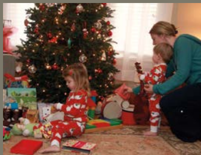
Opening Christmas presents with family in our living room.