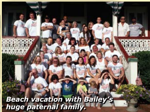
Beach vacation with Bailey's huge paternal family.